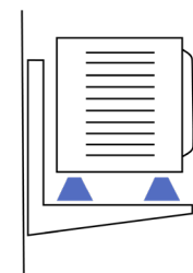
Motors and pumps